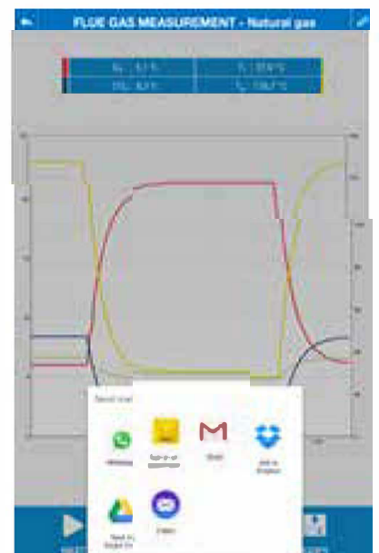
Sending the measurement data to customer