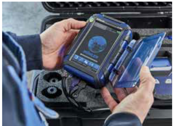
Sturdy and enclosed in a case.