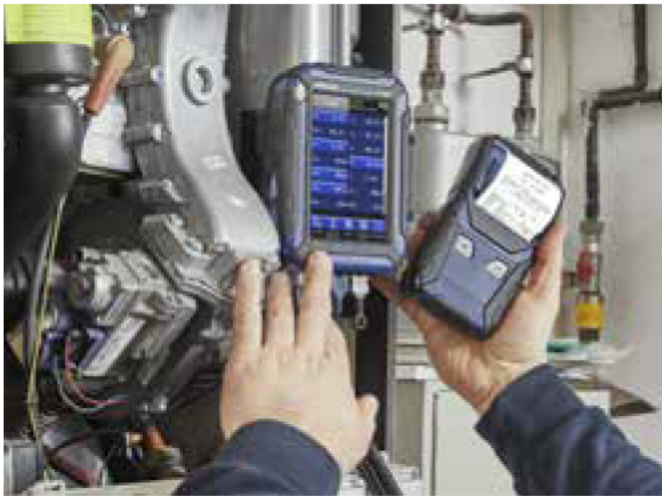
Printout of the measured data on site.