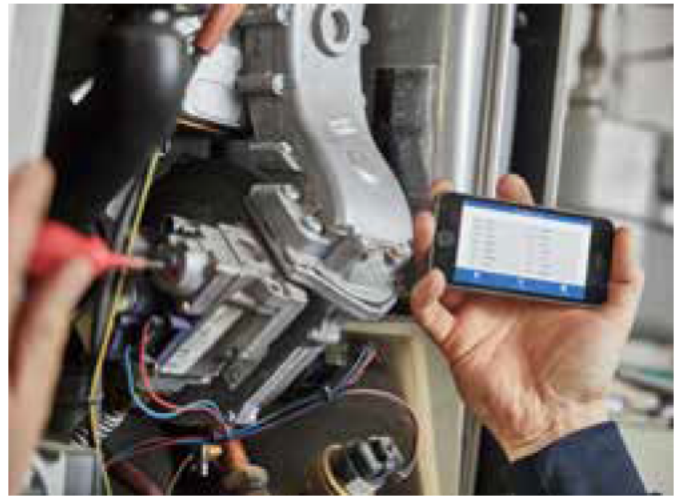
Wohler A 450 app: Displaying the measured data on a mobile device.