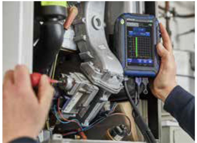
The tuning guide offers an advanced guidance to properly adjust the burner.