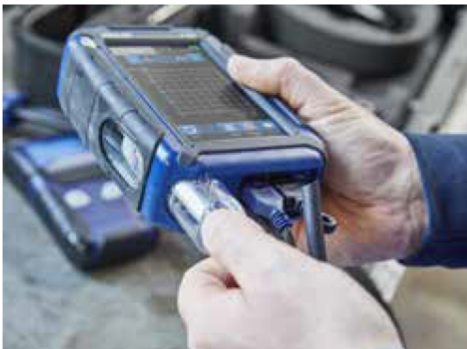
Simple maintenance – The condensate trap can easily be removed.