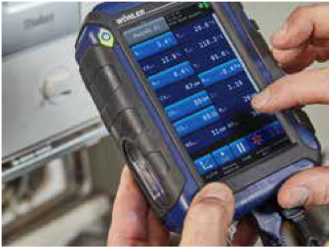
All measured values available at a glance with high-resolution display.