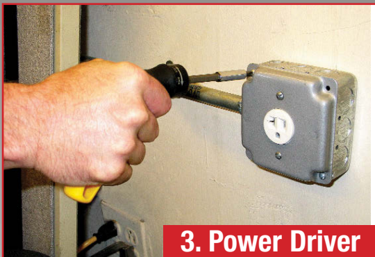
3. Power Driver