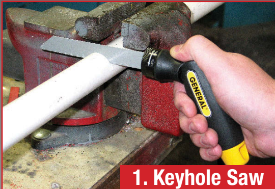
1. Keyhole Saw

The keyless quick change locking chuck accepts both quick change power bits and industry standard reciprocating saw blades