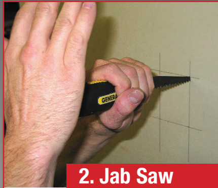
2. Jab Saw