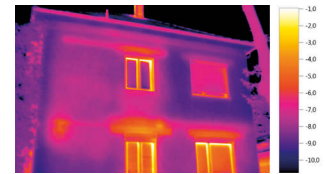
Thermal image with ScaleAssist