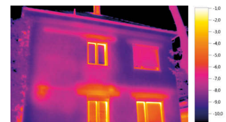
Thermal image with ScaleAssist