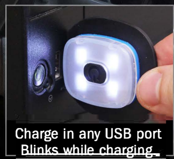
Charge in any USB port Blinks while charging.