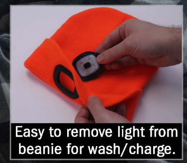
Easy to remove light from beanie for wash/charge.