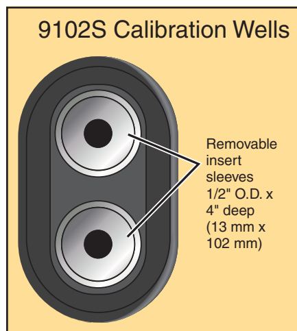
9102S block configuration. Instrument includes 1/4" and 3/16" inserts. Order additional sizes as needed.