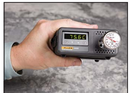
Take the 9100S anywhere. It's the smallest dry-well in the world.