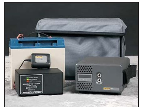
Model 9102S shown with battery pack, which includes a battery, carrying bag, cables, and charger.

We designed many of our field calibrators with removable insert sleeves that have multiple holes drilled for use with a reference thermometer system.