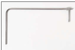
PT12 Pitot Tube, 12 in