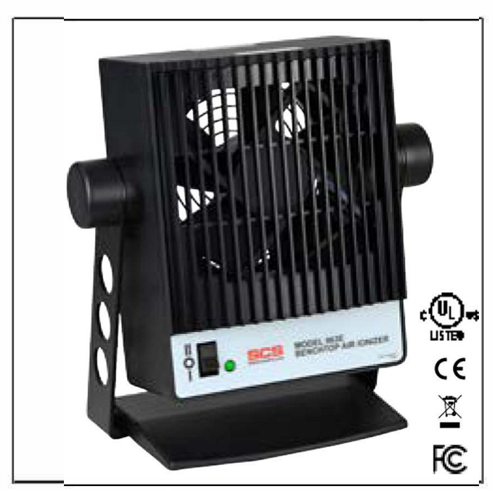
Figure 1. SCS 963E Benchtop Air Ionizer