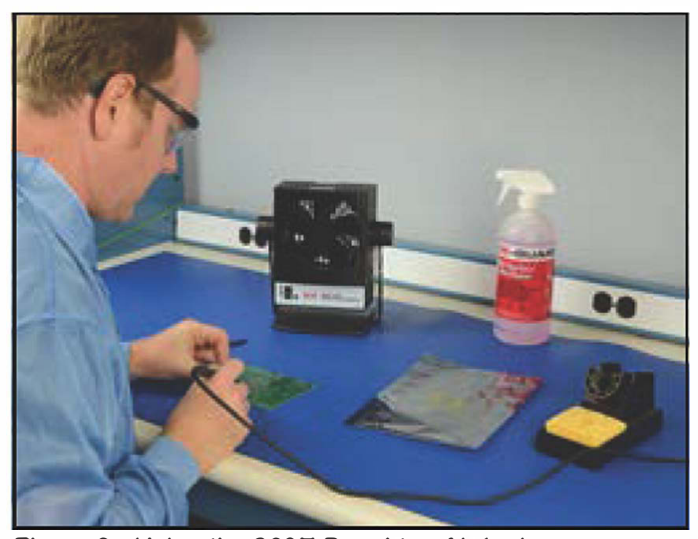
Figure 2. Using the 963E Benchtop Air Ionizer