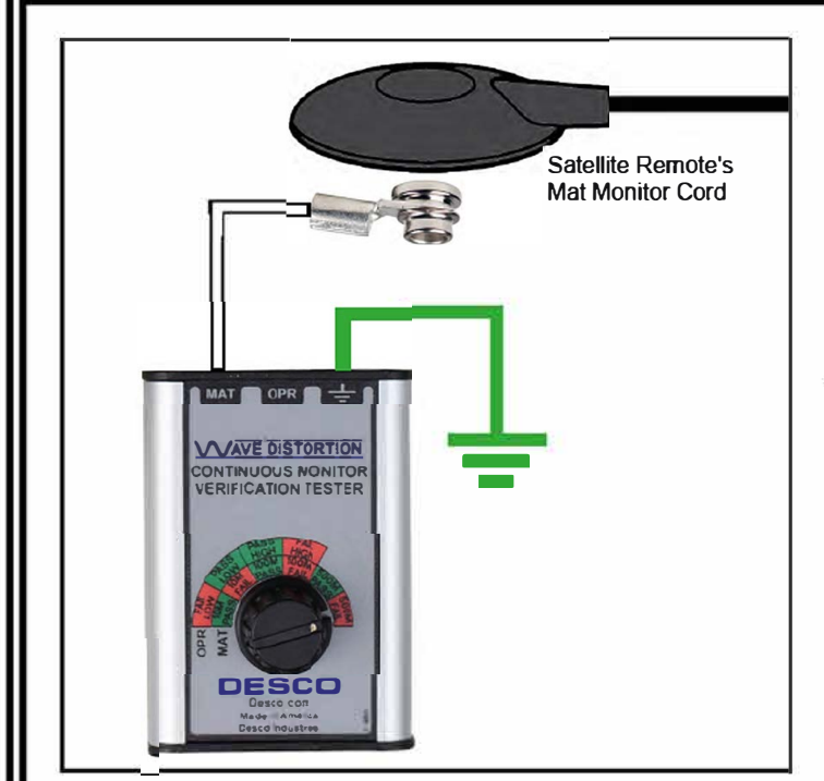
Figure 9. Connecting the Wave Distortion Monitor Verification Tester to the satellite remote's mat monitor cord