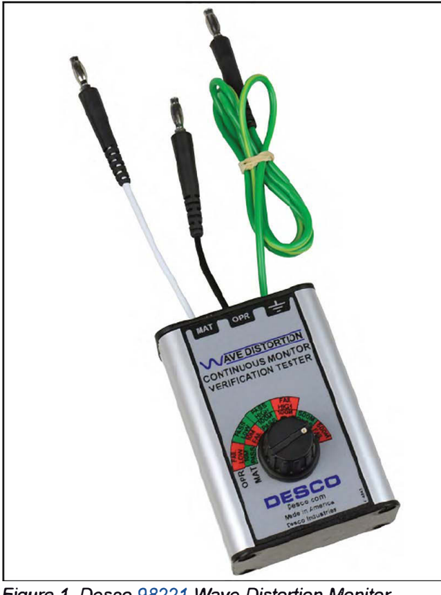
Figure 1. Desco <u>98221</u> Wave Distortion Monitor Verification Tester