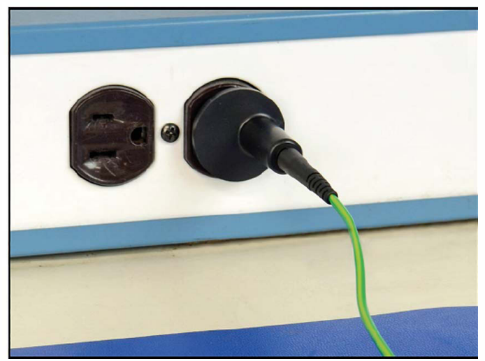
Figure 3. Using the Ground Plug Adapter to ground the Wave Distortion Monitor Verification Tester

Connect the Wave Distortion Monitor Verification Tester's green ground lead to equipment ground. This may be done using the included Ground Plug Adapter or alligator clip.