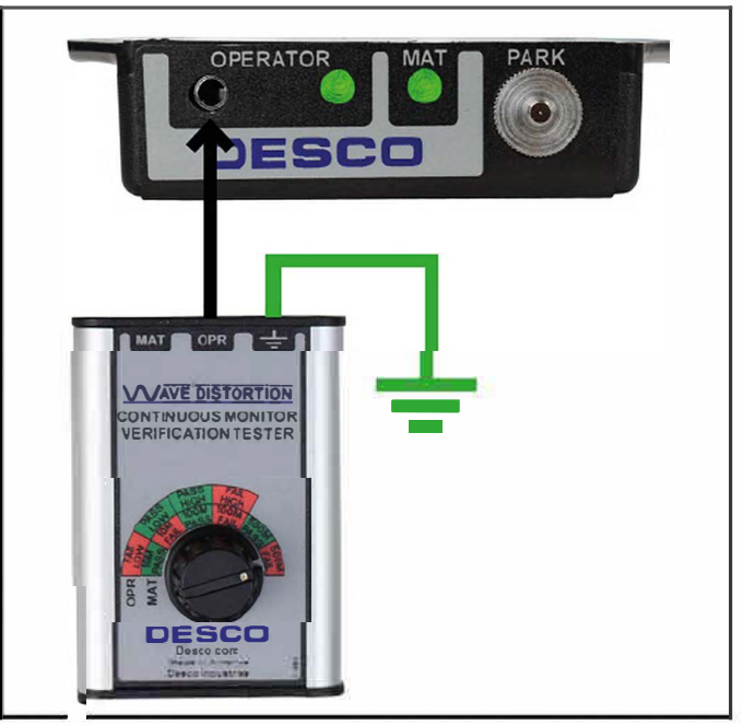
Figure 6. Connecting the Wave Distortion Monitor Verification Tester to the Multi-Mount Monitor's operator jack