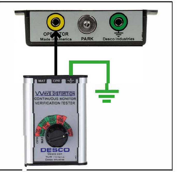
Figure 8. Connecting the Wave Distortion Monitor Verification Tester to the satellite remote's operator jack