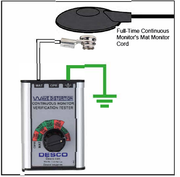
Figure 11. Connecting the Wave Distortion Monitor Verification Tester to the Full-Time Continuous Monitor's mat monitor cord