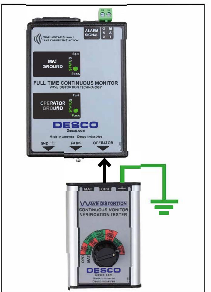
Figure 10. Connecting the Wave Distortion Monitor Verification Tester to the Full-Time Continuous Monitor's operator jack