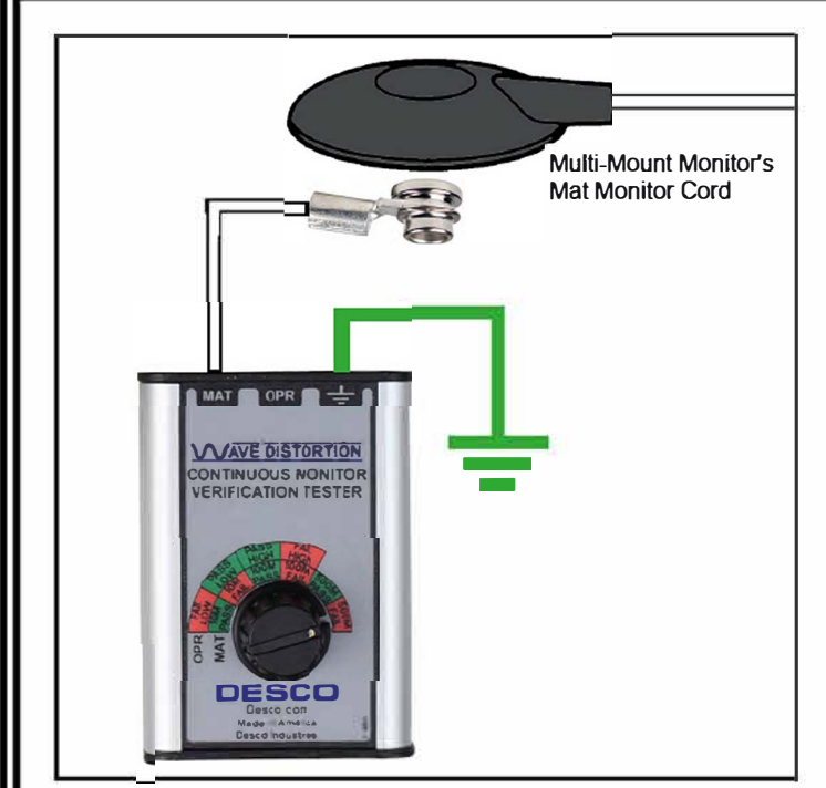
Figure 7. Connecting the Wave Distortion Monitor Verification Tester to the Multi-Mount Monitor's mat monitor cord