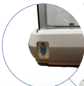
RS232 port for Printer and PC connection

Series Tx models have adjustable feet and a leveling bubble to ensure correct installation. Note: For optimal weighing performance, the Tx semi micro model must be installed on a suitably stable surface such as a marble slab table.