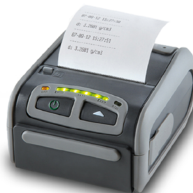
Thermal Printer Order No. W3130

The W3130 Thermal Printer offers a small footprint, modern design, and is compatible with Accuris series Dx and Tx Analytical Balances. Connection is easy with the included cables, and weight values and other critical info can be printed quickly and clearly. The W3130 printer connects to AC power (100V to 240V) with an included power adapter, and also features an included rechargeable Li-Ion battery.