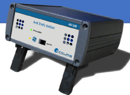
Compact Ionizer Order No. W3120

Static charge can accumulate on many types of samples as well as weighing containers, affecting mass determination on an analytical balance. The Accuris ASI-100 produces and emits negatively and positively charged ions that will neutralize static electricity on samples and containers. A blower can be turned on for rapid static discharge, or turned off for work with powders or light-weight materials.