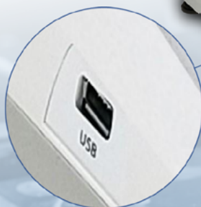
USB Port for flash drive connection