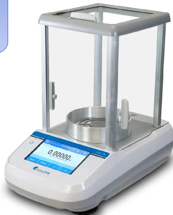
W3002A-120 Semi Micro Balance With Color Touch Screen

Readability: 0.1mg or 0.01mg Capacity: 120g or 220g