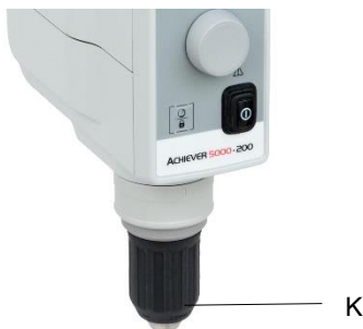
Figure 1. e-A51ST200

The overhead stirrers with electronic speed control, brushless motor, and advanced safety features are able to satisfy the most difficult laboratory applications in terms of viscosity and volume. The new chuck ensures higher safety for the operator and allows to use a passing rod of up to 8.5mm in diameter.