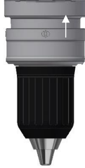
Figure 5. Open position