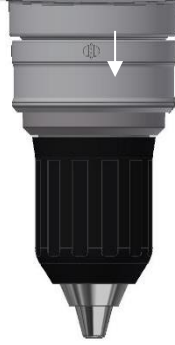
Figure 4. Intermediate position