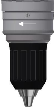
Figure 3. Working position