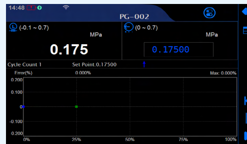
Pressure gauge / transmitter / switch calibration