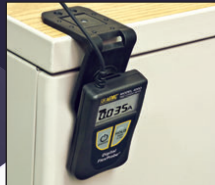
Simply hang on the edge of a table or door