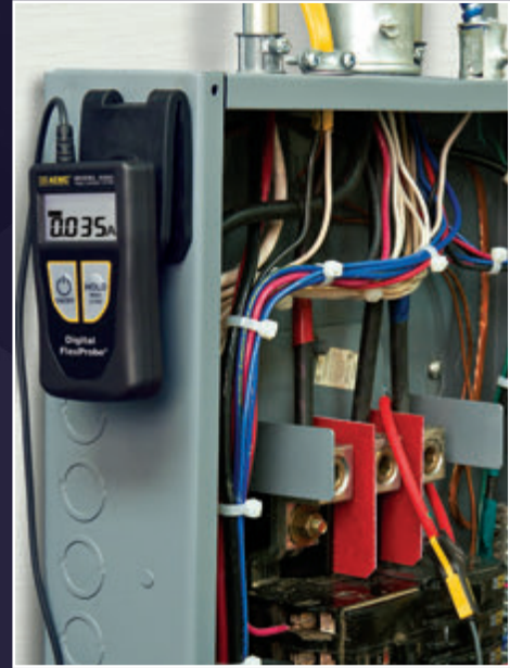
Built-in magnet on the MultiFix accessories provides easy mounting to metal surfaces

We know your hands are your livelihood. That's why the FlexProbe® is designed for comfortable use, even when you're sporting bulky gloves. Plus, the optional MultiFix mounting system lets you hang, clip, or magnetically attach it anywhere you need for hands-free convenience.