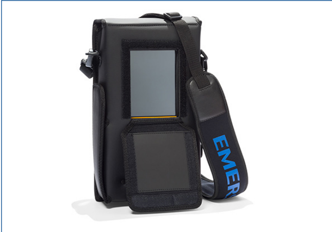
The useful carrying case protects your Trex unit in the field and provides storage options for accessory items.