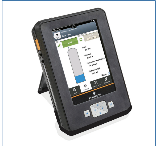
View geometric profiles of your tank to ensure configuration accuracy.