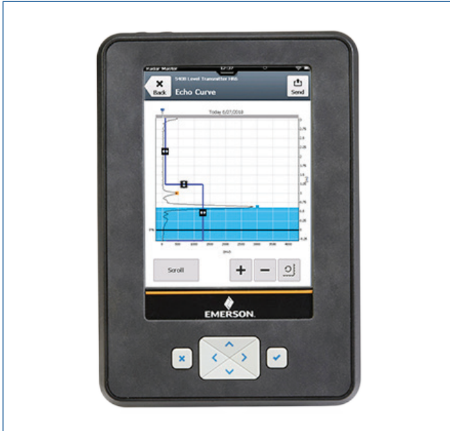
More easily tune radar measurements with enhanced echo curves.