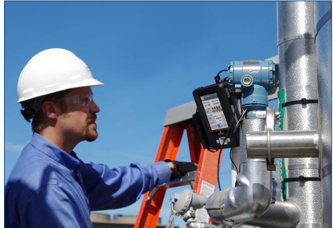
The magnetic hanger accessory allows you to attach the Trex unit to a pipe, freeing up your hands for other work.

You can also verify whether the DC voltage is correct in HART loops.