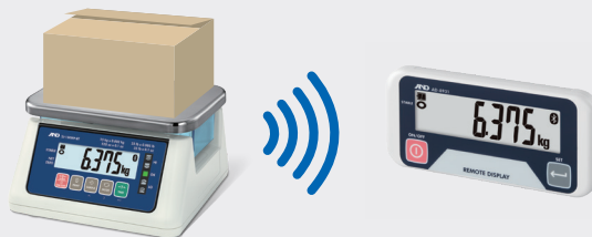
SJ-WP BT Series

For the SJ-WP-BT models, add Bluetooth connectivity with the AD-8541-PC. Send commands from a PC and receive data from the scale. Save time when setting or changing the comparator limits with this handy add-on. Range approx. 10 m.