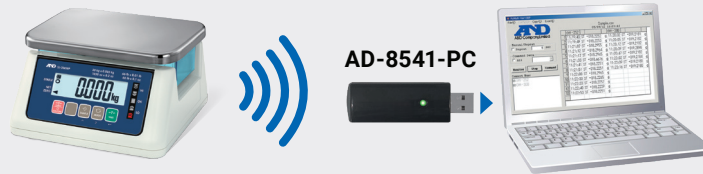
SJ-WP BT Series

For the SJ-WP-BT models, add Bluetooth connectivity with the AD-8541-PC. Send commands from a PC and receive data from the scale. Save time when setting or changing the comparator limits with this handy add-on. Range approx. 10 m.