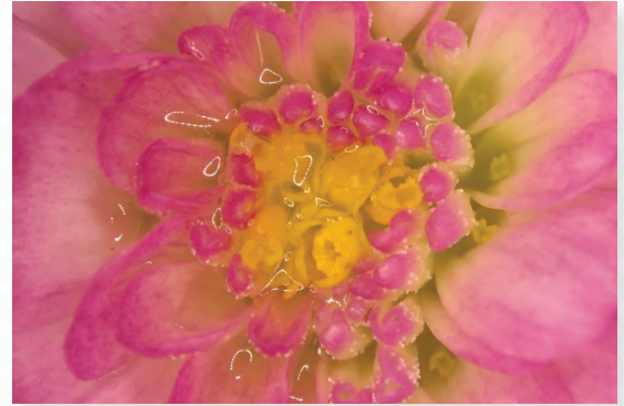
4K Ultra HD Capture High Resolution Images