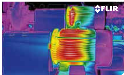
Continuous monitoring of a motor.