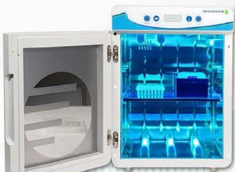
6-bulb design with UV-C transparent shelf for 360° exposure