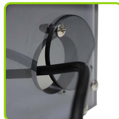
Convenient access port for power cables