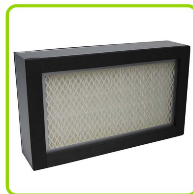
High efficiency, long-lasting HEPA filter included

Ample lighting is provided by an energy efficient LED light source. Up to 3 standard size pipettes are accommodated by the pipette holder integrated within the storage shelf. Pipette tips and small instruments can also be stored away from the main workspace when not in use. Power cables can easily be routed through the access port on the right side of the chamber.