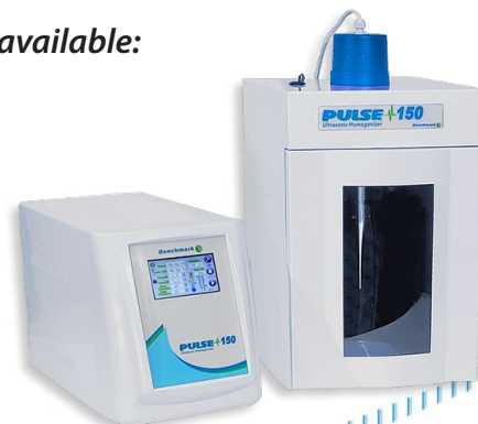
Pulse 150 Ultrasonic Homogenizer 150W for volumes to 150ml