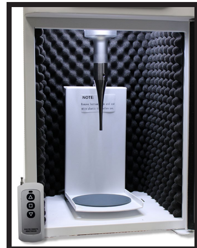
Soundproof enclosure with lights, motorized lift and remote control