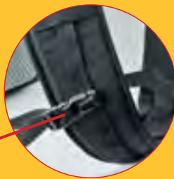
Right Shoulder Setup (Default)