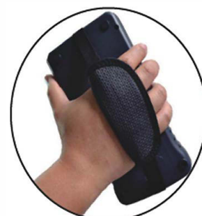
With a hand strap for easier holding