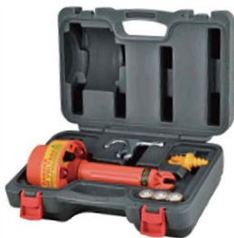
• Carry case