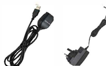
Data Transmission Cable