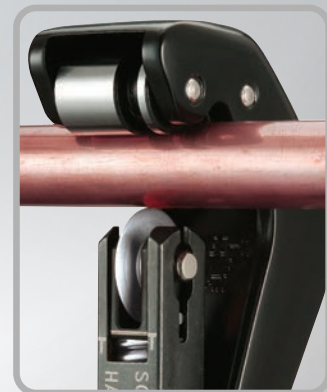
BTC350 Medium Large

Tube Capacity 1/8" ~ 1-5/8" (3 MM ~ 41 MM)