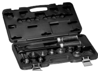
BTLE9 or BTLE9M Kits