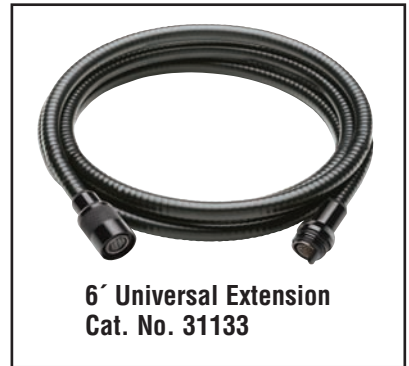
6' Universal Extension Cat. No. 31133