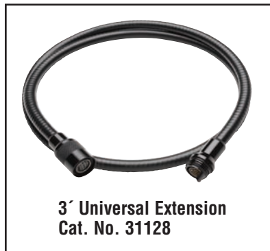
3' Universal Extension Cat. No. 31128