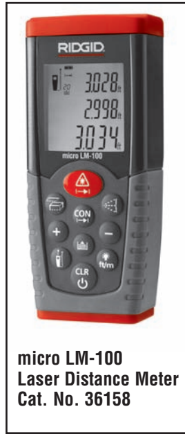
micro LM-100 Laser Distance Meter Cat. No. 36158