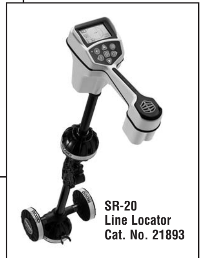
SR-20 Line Locator Cat. No. 21893