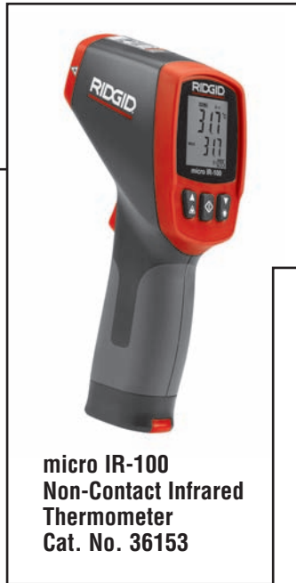
micro IR-100 Non-Contact Infrared Thermometer Cat. No. 36153