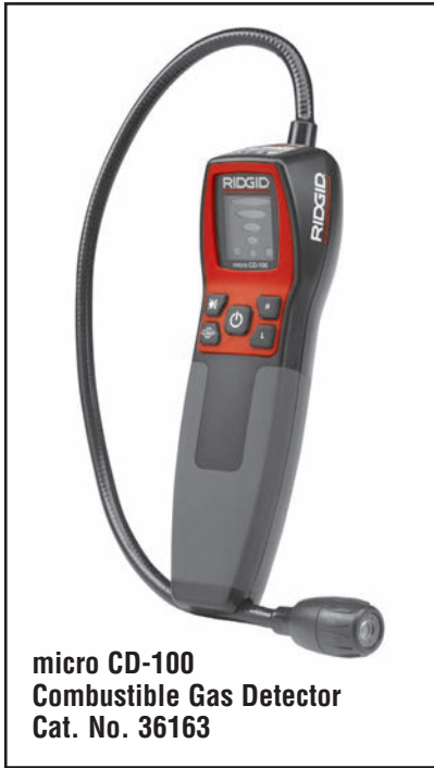
micro CD-100 Combustible Gas Detector Cat. No. 36163