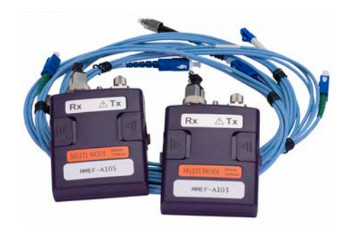
1. Append model number with -NA, -UK, -EU, -AU for regional power cords. Multimode (encircled flux) modules

Copper kits ship with all adapters and cords for testing links and channels to CAT6A/Class EA. Class FA adapters are available. The mainframe tests to beyond 2000 MHz and is CAT8 ready.