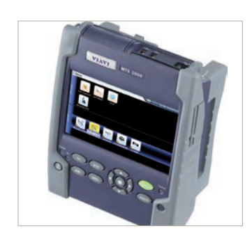
For more fiber testing and certification capabilities, combine the Certifier40G with one of the market-leading VIAVI fiber testers, such as the T-BERD/MTS-2000 and OLTS-85P