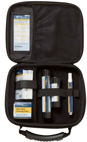
Fiber Optic Cleaning Kit NFC-Kit-Case

Touch the swab to the wet spot on the wipe for 3 seconds to absorb a minimal amount of solvent. A damp swab works better than a wet one. Applying solvent from the pen directly to the swab will likely result in excessive solvent.