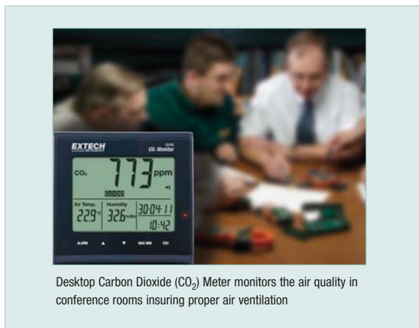
Desktop Carbon Dioxide (CO 2 ) Meter monitors the air quality in conference rooms insuring proper air ventilation