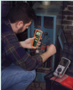
Ideal for performing service checks on furnaces and hot water heaters