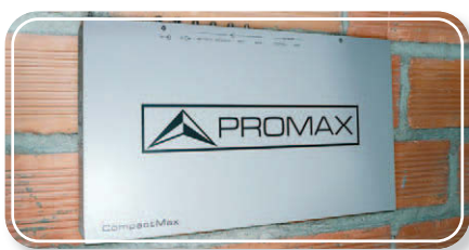
▲ WALL MOUNTING AVAILABLE ▲

CompactMax-1 is a compact transmodulation system that allows to distribute Satellite TV channels (DVB-S or DVB-S2) in Digital Terrestrial Television (DVB-T) format. It can be connected to up to 4 satellite inputs (2 inputs for free channels and 2 for encrypted ones) to deliver up to 8 DVB-T muxes with dynamic webserver management via remote control. It is integrated into a 19" 1U Rackmount case. It can also be mounted directly on the wall.