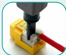
Punch and cut cable terminals

Ergonomic handle to reduce impact recoil and hand fatigue