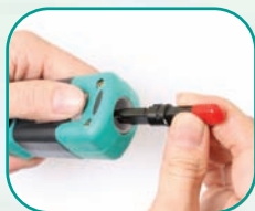
Storage for a spare blade