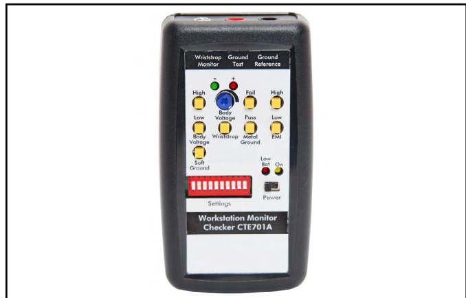
Figure 3. SCS CTE701 Workstation Monitor Checker

The checker verifies the proper operation of dual wrist strap monitoring. Connect a 3.5 mm test cable to both the checker and to the operator jack of the monitor. At this point the monitor should indicate failure. Depress the Pass button on the wrist strap section. The monitor should indicate a good connection. While pressing the Pass button, press body voltage “high.” At this point the Wrist Strap LED would be blinking red.