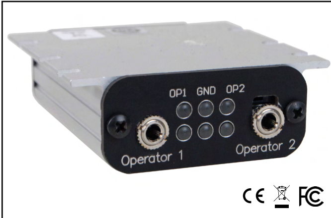
Figure 1. SCS CTC337 Wrist Strap and Ground Monitor