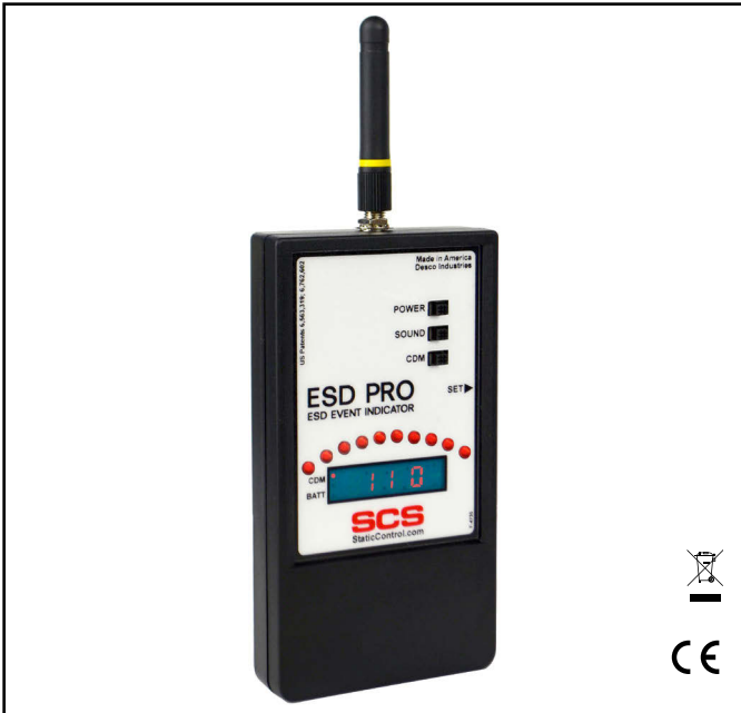
Figure 1. CTM082 ESD Pro ESD Event Indicator.