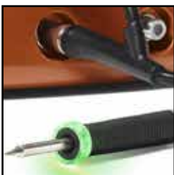
LED equipped hand piece signals to operator when a good solder joint is formed.