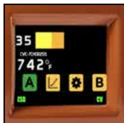
Tip temperature displayed on large color screen.