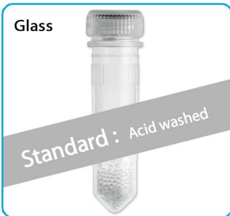
Standard Glass beads (Acid Washed)

* Supplied with US plug, for EU plug, please add (-E) to item number.