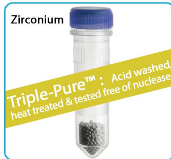
Triple-Pure™ (Molecular Biology Grade) Zirconium Beads