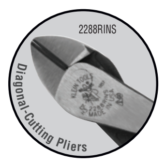
36% greater leverage

Klein Tools Electrician's Insulated pliers and wire strippers are 1000V rated for safety on the job. The multi-color, sleek design with small thumb guards provides comfort for all day use, while also making for easy handling and storage. The durable, molded insulation meets or exceeds IEC 60900 and ASTM F1505 standards for insulated tools.