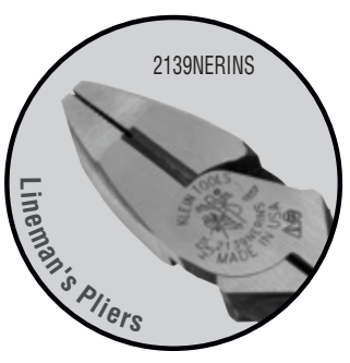
46% greater leverage Sure-gripping cross-hatched knurled jaws