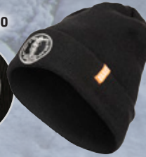
Heavy Knit Hat 60388 Heavy knit provides extra warmth and includes the Klein Tools vintage logo.