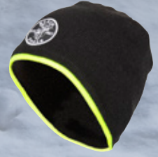
Knit Beanie 60391 Soft fleece liner with a snug fit and high-visibility yellow trim.