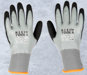
Coated Thermal Gloves 60389 (L) & 60390 (XL) Fully coated latex shell with acrylic fleece liner for ultimate warmth in cold weather. Textured palm for secure gripping.