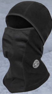
Wind Proof Hinged Balaclava 60132 Stretchable, one-piece fleece with unique hinged design allows for use as a neck gaiter.