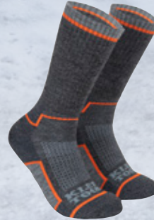
Performance Thermal Socks 60508 (L) & 60509 (XL) Made in the USA. Merino wool wicks moisture away from skin reducing sweat and odor.