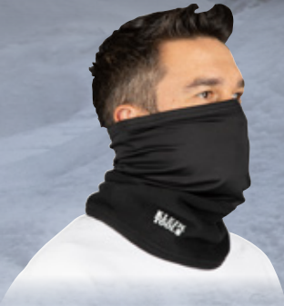
Neck and Face Warming Half-Band 60466 Double-layered performance knit material on the top with anti-odor treatment. Warm fleece on the bottom to block cold.