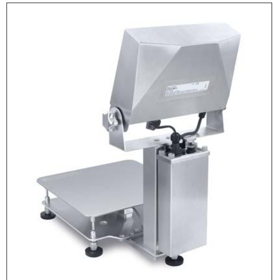
Optional External Power Bank Holder for i-D61XWE Models