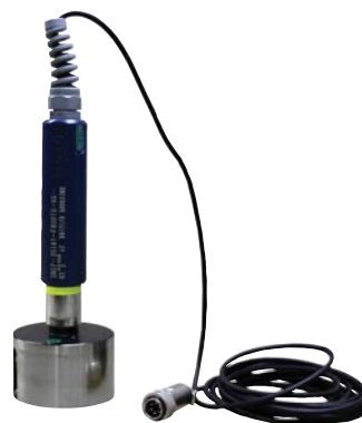
Customized Electric LVDT Sensor ordered separately.