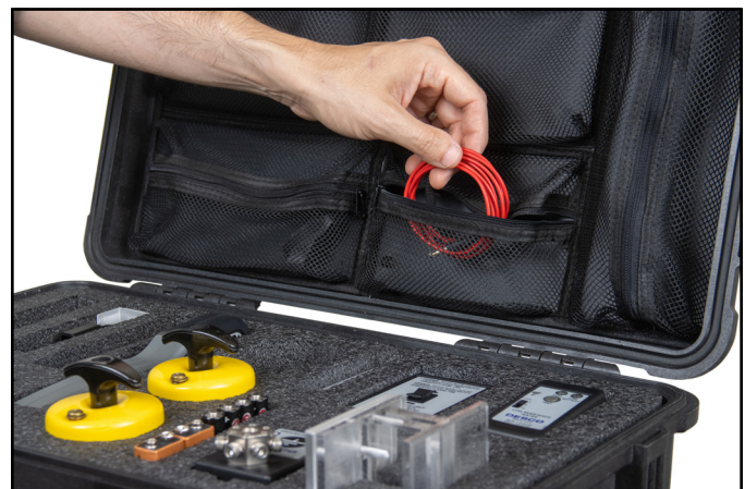
Figure 2. Using the ESD Survey Kit's lid organizer

The ESD Program Standard ANSI/ESD S20.20 can be downloaded here: https://www.esda.org/standards/