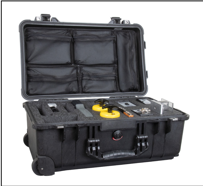
Figure 1. Desco 19791 ESD Survey Kit