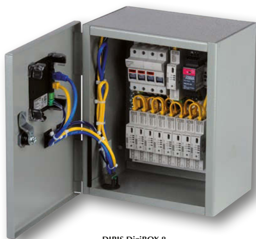
DIRIS DigiBOX 8 Centralization and display of data

Enclosed multi-point metering solution for retrofit applications