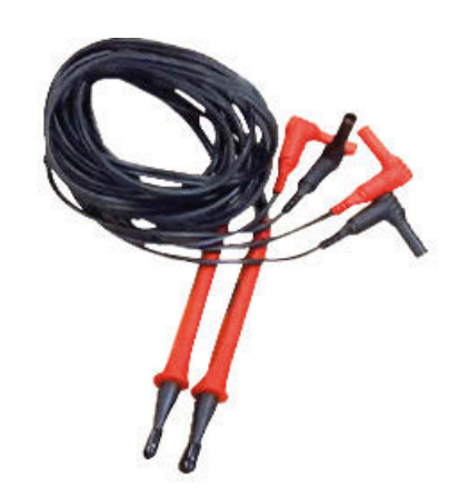
6 ft CAT IV 300 V rated compact kelvin probes, 4 mm shrouded plugs