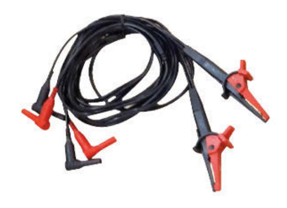
6 ft CAT IV 300 V rated compact kelvin clips, 4 mm shrouded plugs