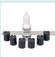
DO603 Membrane Kit includes 6 screw on membrane caps, 15mL filling solution and polishing paper