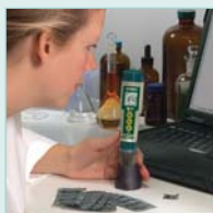
Sample testing with the meter in a laboratory environment