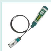
Extension cable attached to meter