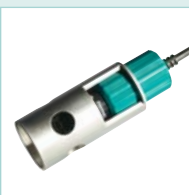
Choice of optional 3ft (1m) or 16ft (5m) extension cable with probe weight