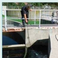
Sample testing with extension cable attached to meter