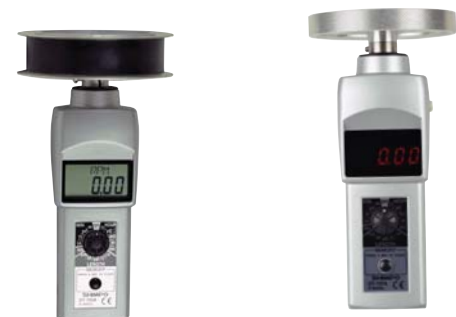
12" Cable Wheel