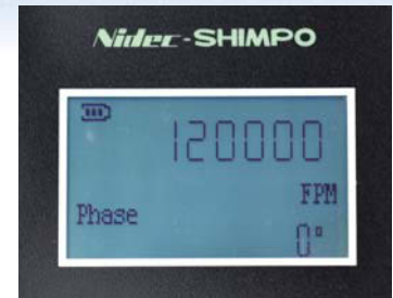
LED Panel Display Close-up