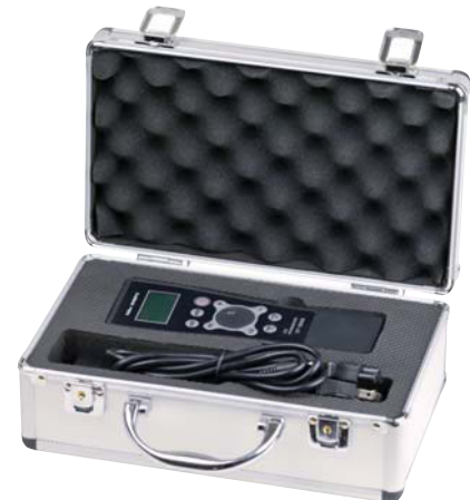
DT-326B in Included Protective Carry Case.