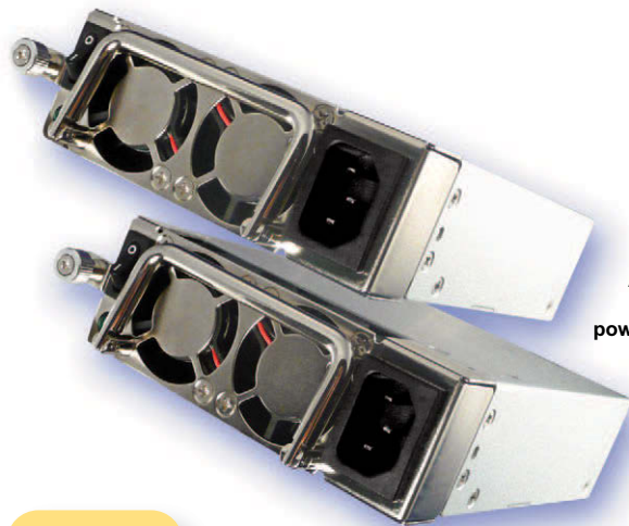
AL-802 (spare power supply)