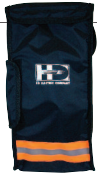
B-30 Carrying Bag

PT-DVI Proof Tester To test the DVI using an external voltage source, the PT-DVI Proof Tester should be used before and after each use to verify proper operation.