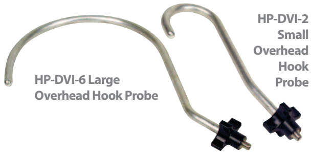
HP-DVI-6 Large Overhead Hook Probe