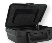
Protective carrying case