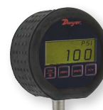
DPG-100 with protective rubber boot